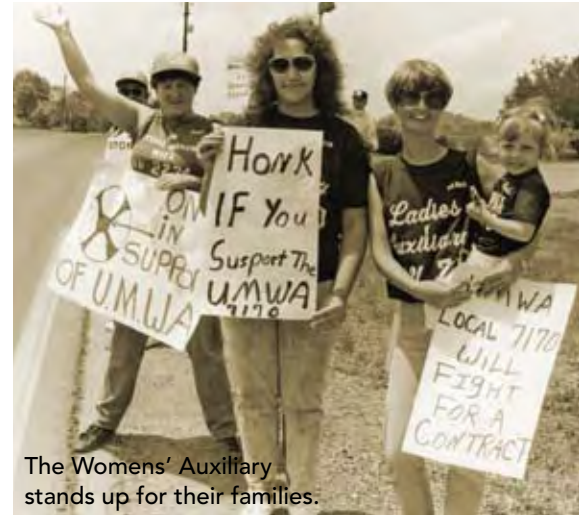
The Womens' Auxiliary stands up for their families.