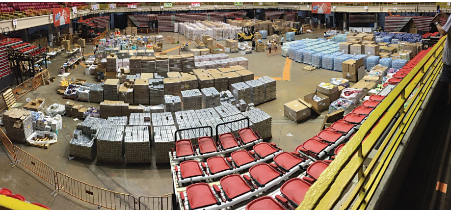
Left: Thousands of pounds of donated items—including food, water, medicines, generators, and other goods—are readied for delivery to residents of Puerto Rico. Below: Hurricane Maria brings devastation to much of the Caribbean island.